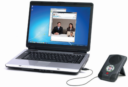
Plug and play simplicity for Microsoft® Lync®