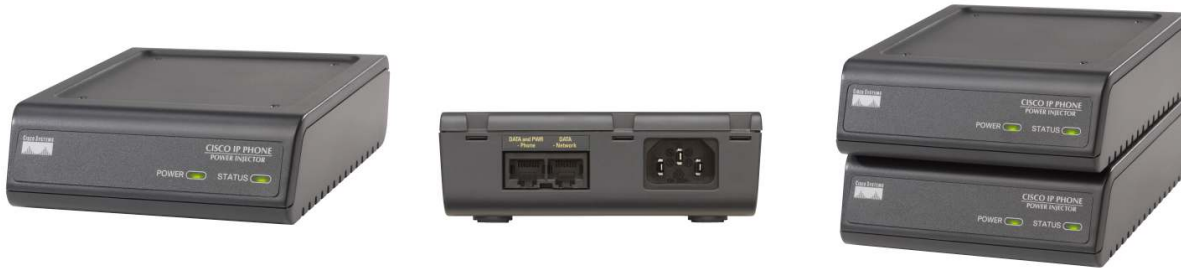
Figure 1. Cisco Unified IP Phone Power Injector (Front, Back, and Stacked Views)

The Cisco Unified IP Phone Power Injector is a midspan power injector designed and tested for use with Cisco Unified IP phones. The Cisco Unified IP Phone Power Injector sits between a switch port and the Cisco Unified IP phone, providing inline power capability to an unpowered switch port. It supports Cisco midspan power, IEEE 802.3af modes for supplying power to the attached phone, and 10/100/1000BASE-T Ethernet connections. Figure 2 shows the maximum distance of the Cisco Unified IP Phone Power Injector between a Cisco Unified IP phone and an Ethernet switch.