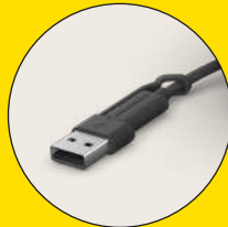
USB C and USB A connectors included