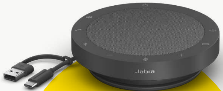
MS TEAMS & UC VARIANTS

We consider sustainability carefully at every stage of product development. The casing of Speak2 55 is made with over 50% sustainable materials**, and has a number of built-in parts that can be repaired or replaced. Better sustainability = longer speaker life = great calls for you and your team for years to come.