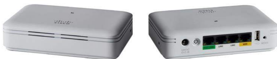
Figure 1. Cisco Aironet 1815t Access Point

The Cisco® Aironet® 1815t Access Point (Figure 1) offers a highly secure enterprise wired and wireless connection to the home, micro-branch, or any type of remote sites. No longer will geography or the elements play a role in delaying productivity, as the 1815t extends the corporate network to teleworkers, mobile workers, and even micro-sites. The access points connect to the home or on-site broadband Internet access and establish a highly secure tunnel to the corporate network. This tunnel allows remote employees access to data, voice, video, and cloud services for a network experience consistent with that at the corporate office. The 1815t supports highly secure access to corporate data and personal connectivity for teleworkers' home devices, with segmented home traffic.