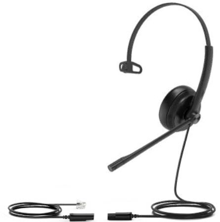
YHS34/YHS34 Lite Mono

Built for comfort with soft ear cushions and ultra-lightweight materials, the YHS34/YHS34 Lite is 10%~30% lighter than other headsets in the same range. Its ergonomic design makes this headset comfortable enough for long conference calls and all day use.